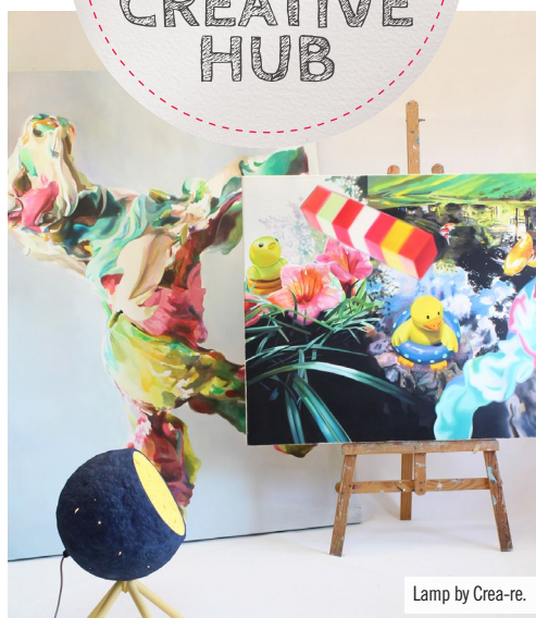
Lamp by Crea-re.